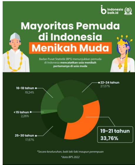
Figure 1. BPS data for 2022 regarding the Age Range for Early Marriage in Indonesia

Indonesia will have their first marriage age in the range of 19-21 years in 2022. Then, as many as 27.07% of young people in the country will have their first marriage age. at 22-24 years old. There are also 19.24% of young people who married for the first time when they were 16-18 years old.