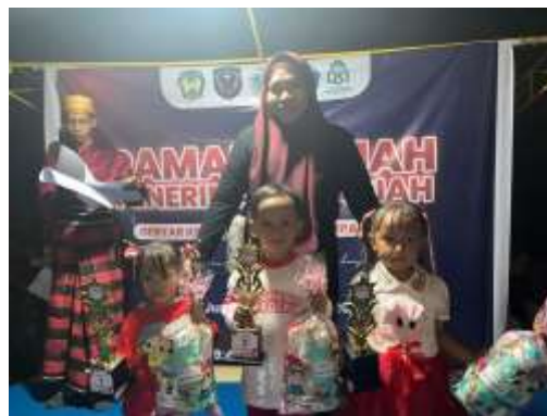
Figure 3. Receiving Prizes for the Kindergarten and Elementary School Competition Categories

Gifting gifts in the celebration of Independence Day on August 17 in Bontoboddia Hamlet is interpreted in terms of material value and the symbolic value contained therein. Gifts are a form of appreciation for residents' participation, efforts, and contributions in competitions and other activities. Giving these awards creates a sense of community appreciation and recognition, thus positively impacting individual motivation to continue participating in social activities.