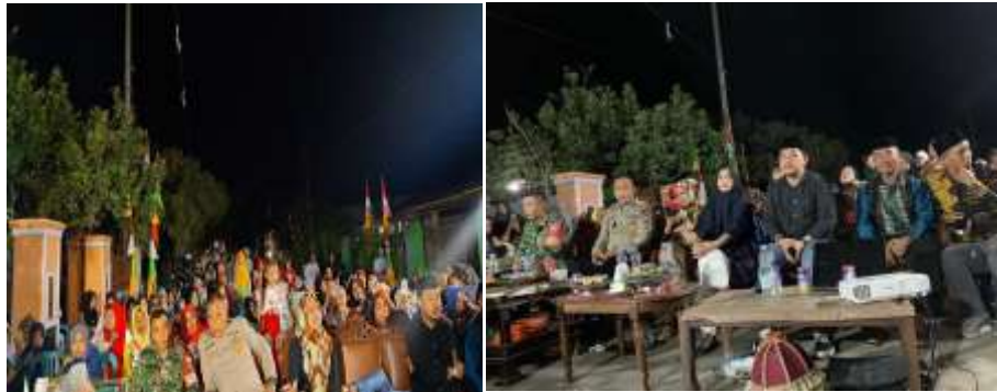
Figure 2. Enthusiasm of Residents and Local Government

physically but also emotionally, thus strengthening social ties in their environment. This is evident from residents' enthusiasm for attending the socializing activities, as seen in the picture.