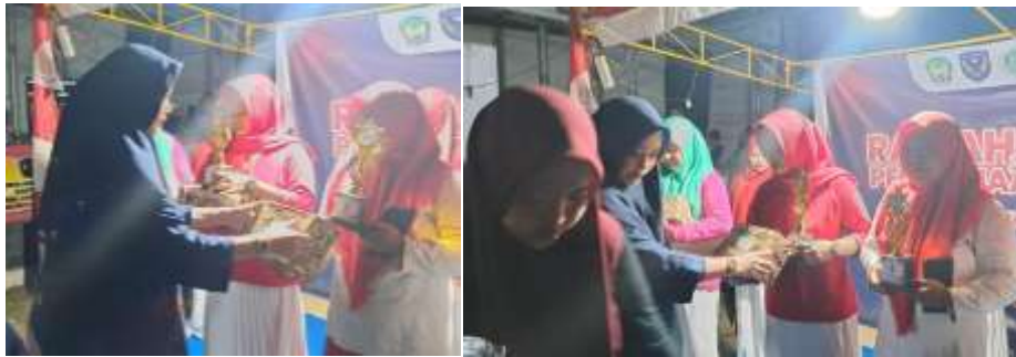
Figure 4. Receiving Prizes for the General and PKK Mother Competition Categories