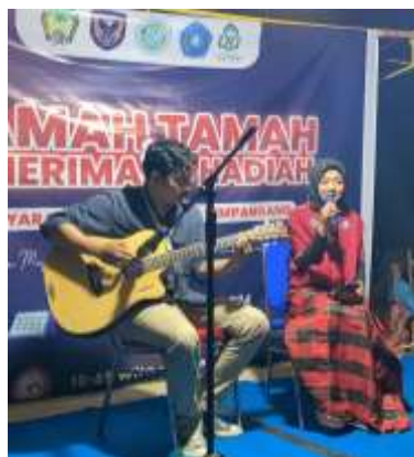
Figure 7. Acoustic Duet

The performance of drama in the celebration of Independence Day on August 17 in Bontoboddia Hamlet is one of the important elements that enliven the event while conveying moral and historical messages to the community. The dramas that are performed often revolve around the theme of the struggle for independence, national values, and the spirit of unity and cooperation. Although lighter and more entertaining, drama has the power to touch the audience's emotions and leave a deep impression regarding the meaning of independence and togetherness. Through drama, the society of Bontoboddia Hamlet celebrates independence and emphasizes their commitment to the noble values that the nation's heroes have inherited. Although simple, the performance of this drama is part of the learning process and strengthening of social identity that builds togetherness in the community.