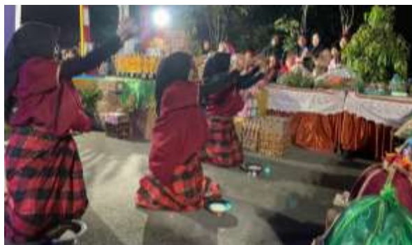
Figure 5. Paddupa Dance Performance

In a series of activities to celebrate Independence Day on August 17 in Bontoboddia Hamlet, art and cultural performances are one of the sub-activities that help strengthen community solidarity and togetherness. Art performances, such as regional dances, traditional music, or drama performances, serve as entertainment and a medium to express local cultural identity, which is part of the local community's pride.