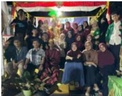
Figure 9. Group Photo of the Event Committee

One way is to hold regular discussions or periodic meetings between the activity committee and residents. Residents can provide input, express opinions, and prepare work plans in this meeting more clearly and transparently. Open discussions involving all parties can also avoid misunderstandings or conflicts that are detrimental to the smooth running of the event. In addition, improving coordination can create a sense of togetherness and shared responsibility in making the celebration successful.