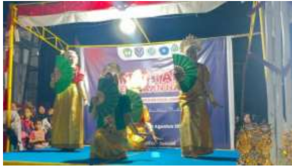
Figure 8. Performance of 4 Ethnic Dances

The acoustic duet is one of the most popular musical elements in the celebration of Independence Day on August 17 in Bontoboddia Hamlet. This performance involves two singers or musicians collaborating, accompanied by a simple musical instrument, an acoustic guitar. Acoustic duets provide a more intimate and familiar nuance, making the audience emotionally close to the performers. In addition to being a form of entertainment, acoustic duets in this celebration also have a symbolic meaning (Jovani, 2023). Soft acoustic music and harmonious vocal blends create a warm and togetherness atmosphere. Through this performance, the musicians entertain and invite the public to get to know and appreciate local music culture better and absorb the meaning of their songs.