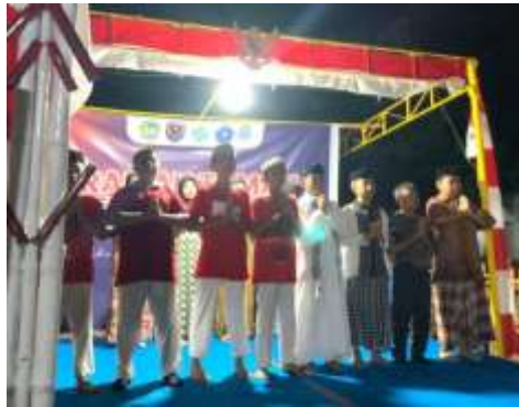
Figure 6. Drama

culture that is their identity. In addition, the Paddupa Dance performance also introduces the younger generation to traditions passed down from generation to generation so that they increasingly appreciate and preserve their regional culture. The Paddupa Dance performance in the celebration of Independence Day is more than just a spectacle (Muhtarom et al., 2021). It becomes a medium to express the spirit of unity and togetherness and strengthen social ties in the society of Bontoboddia Hamlet. This dance serves as a reminder to society that togetherness and mutual collaboration must be maintained and kept in everyday life, not just during festivities but also during larger social events.