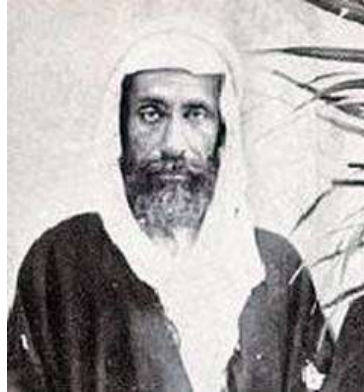
Picture 1: Muhammad bin Abdul Wahhab, the originator or founder of the Wahhabi movement in Saudi Arabia

Furthermore, Muhammad Abdul Wahab initiated the possibility of changing Islam, which became a development. Wahhabism is seen as a traditionalist movement with rapid growth and an attempt to follow direct Islamic lessons based on the Qur'an and hadith. Wahhabi followers call themselves the Muwahiddun group, and that implies an alliance with the purifying lessons of Allah SWT. (Subroto & Ningsih, 2022).