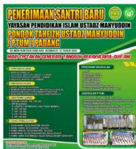
Picture 2. Open Recruitment

At this preparation stage, it starts from open recruitment of students as tahfidz participants.