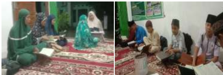
Picture 3. Students do Muraja'ah by themselves

The forms of muraja'ah activities at Pondok Tahfidz Ustadz Mahyuddin (PTUM) vary. First, the students repeat the old memorization on their own. In this case, some of the muraja'ah students repeat their old memorization without looking at the Qur'an, when someone forgets to see the Qur'an. There are also some who repeat their old memorization by reading and looking at the Qur'an.