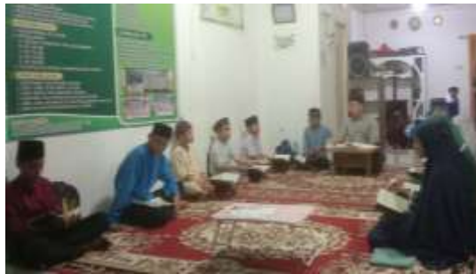
Picture 6. Muraja'ah among Students

Fourth, after finishing all the muraja'ah and ziyadah students in turn, if there is still time left, then before the learning is closed, muraja'ah is held together. In this joint muraja'ah activity, what is read is juz 30. The teacher starts the reading without looking at the Qur'an first and then is followed by the students, then the students read together while the teacher listens and corrects the reading if there is something wrong.