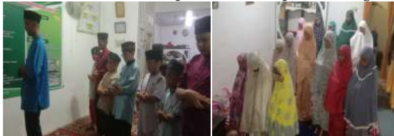
Picture 7. Muraja'ah while Conducting Prayer Together